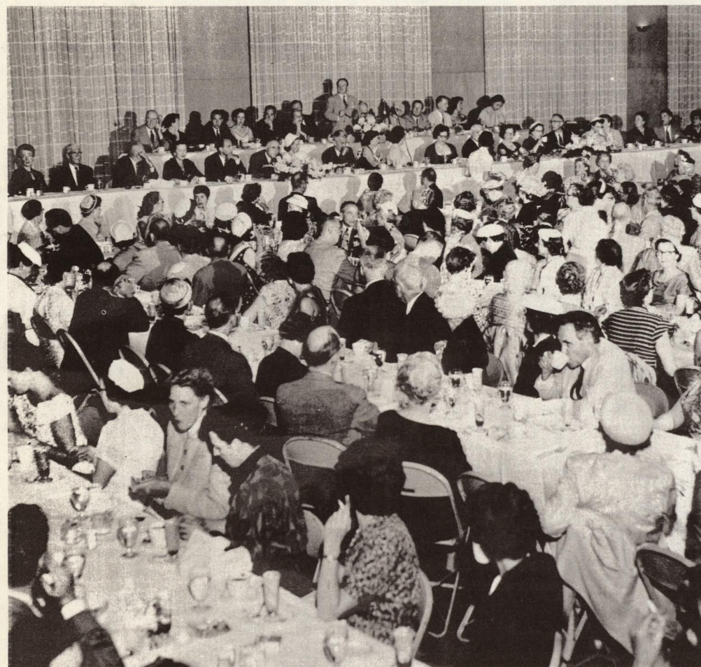
A sectional view of the opening 1956 dinner

Conference Registrants who also make reservations for the Puget Sound Cruise and Olympic Peninsula Shore Dinner at Kiana Lodge, on Sunday, July 28, will have a day of inspiring associations with the Conference Faculty. Special registration is required for the Cruise, as for the Banquet on July 25.