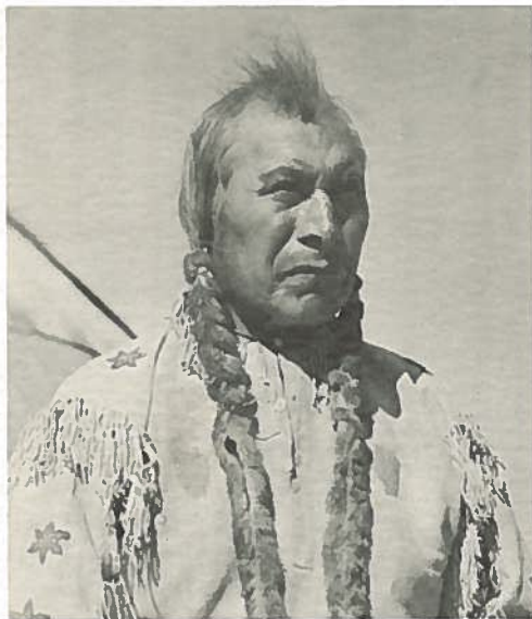
PUCK HYAH TOOT

Parents are invited to bring their children.