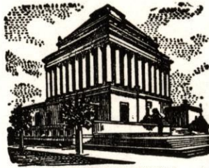
HOUSE OF THE TEMPLE

OFFICE: HOUSE OF THE TEMPLE 1735 16TH STREET, N. W. WASHINGTON, D. C.