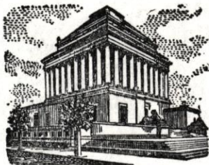
HOUSE OF THE TEMPLE

OFFICE: HOUSE OF THE TEMPLE 1735 16TH STREET, N. W. WASHINGTON, D. C.