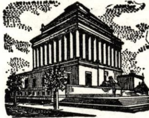
HOUSE OF THE TEMPLE