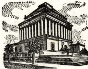
HOUSE OF THE TEMPLE

OFFICE: HOUSE OF THE TEMPLE 1735 16TH STREET, N. W. WASHINGTON, D. C.