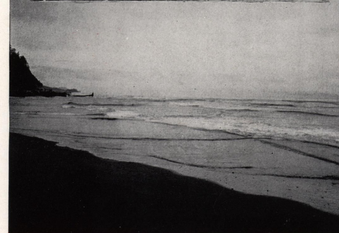
A FAVORITE DRIVE FROM LAKE QUINAULT LODGE