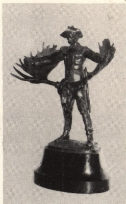
General George Armstrong Custer. Bronze by T. Curts. Mounted on a marble base. Signed. 10½ inches high.