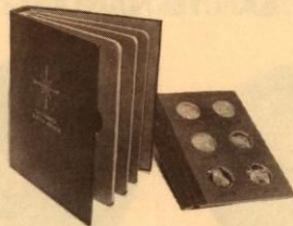
DELUXE HOLDER FOR ENTIRE SERIES OF 22 MEDALS