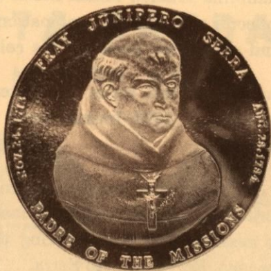
FRAY JUNIPERO SERRA — . . . —

NORTH HOLLYWOOD STAMP & COIN 11738 VICTORY BLVD. NORTH HOLLYWOOD CALIFORNIA ~~~~~ ~~~~~ ~~~~~