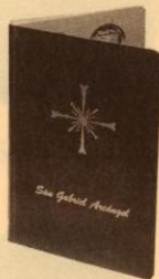
PRESENTATION FOLDER FOR INDIVIDUAL MEDALS OR MATCHED SETS. PLEASE SPECIFY.