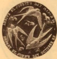
SAN LUIS CAPISTRANO