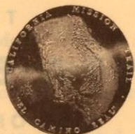
FRAY JUNIPERO SERRA