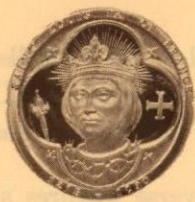
SAN LUIS REY