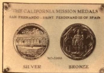
PLASTIC HOLDER WHITE WITH GOLD LETTERING