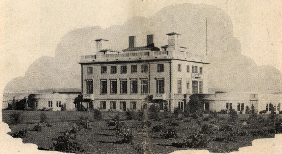
MARYHILL MUSEUM OF FINE ARTS MARYHILL, WASHINGTON