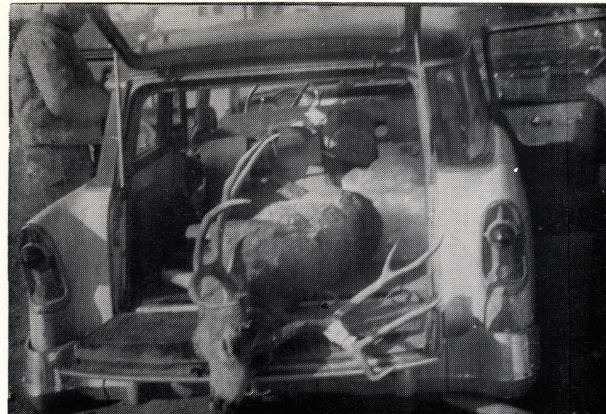
THERE ARE MORE TROPHY BUCKS LIKE THIS ONE AROUND!

We Furnish Everything for One Week Except Your Sleeping Bag. Guide, Food, Tents, Horse. No Party of Less Than 4 Persons.