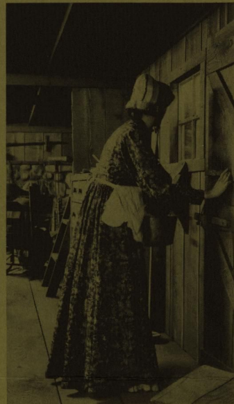
Scene depicts pioneer living.