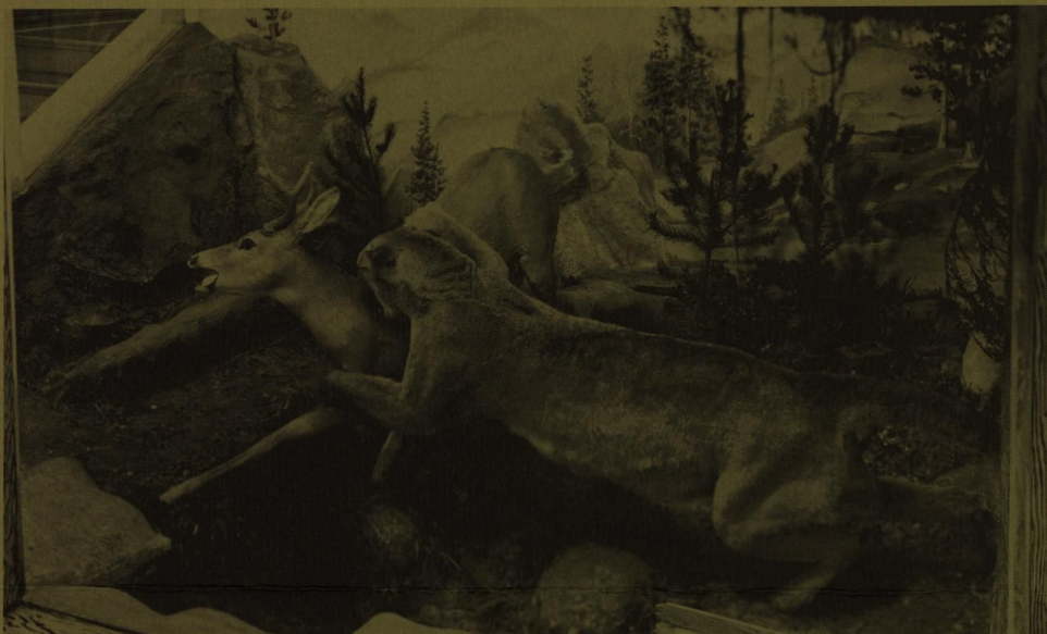
Museum contains many Northwest wildlife displays.