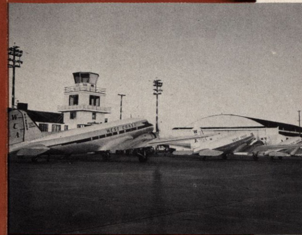
Pasco is served by West Coast Empire Air Lines, with direct service to all major Northwest cities and direct connections to transcontinental service.

We invite you to accept the challenge of this great country . . . come to PASCO . . . the city with big plans for the future . . . where every stranger receives a hearty Western welcome!