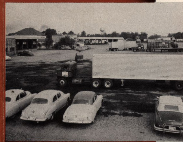
The hustle and bustle of Pasco's motor freight terminals paint a graphic picture of the city's importance as a transportation center.

The Pasco airport is one of the finest. During World War II it was a Navy air training base, and consequently has the very finest facilities, including a fully lighted field with four asphalt runways, four large hangars, an administration building, and 35 warehouse and industrial buildings. West Coast Empire makes ten scheduled stops daily. Pasco's airport is seldom closed by weather and is accessible by air during all four seasons of the year.