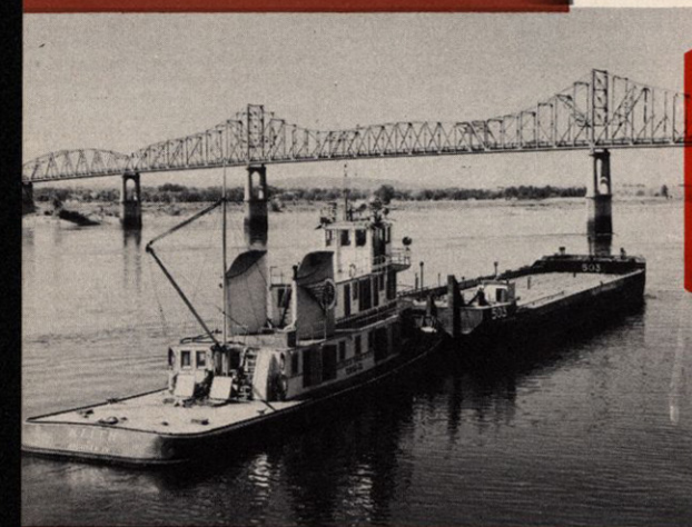
A tug and one of the barges which take wheat to the seaports of Vancouver and Portland . . . and brings petroleum products back upstream for distribution through the vast Inland Empire.