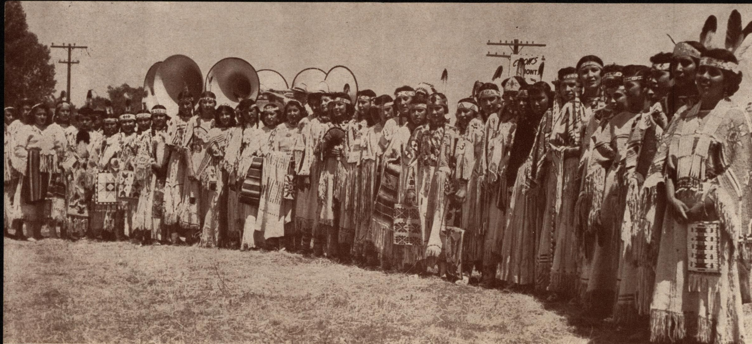
Part of the 53 contestants from 15 states representing 23 tribes, in the 1953 MISS (Indian) AMERICA CONTEST

America's most beautiful and talented Indian girls will compete for the title of MISS (Indian) AMERICA II—modern, charming girls from many tribes and many states join in the friendly contest, winning a trip to New York and Atlantic City and a possible chance in the movies, TV or on the stage. It is not