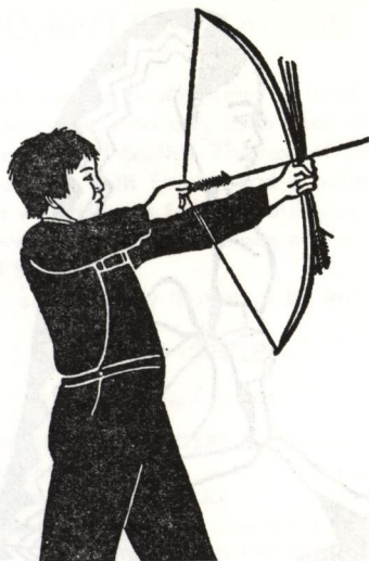
Young Hunter of Picuris