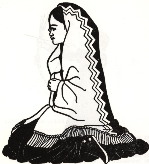
The Little Herder