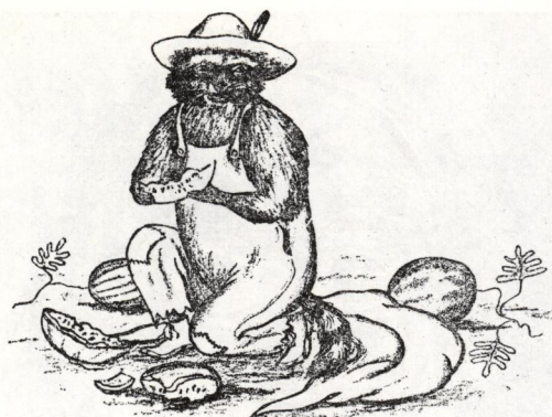
Slim Butte Raccoon