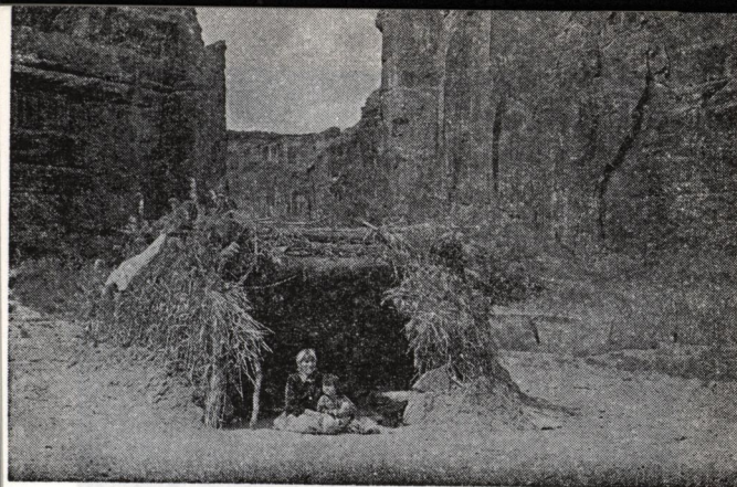
Camping in Canyon del Muerto from Here Come the Navajo!