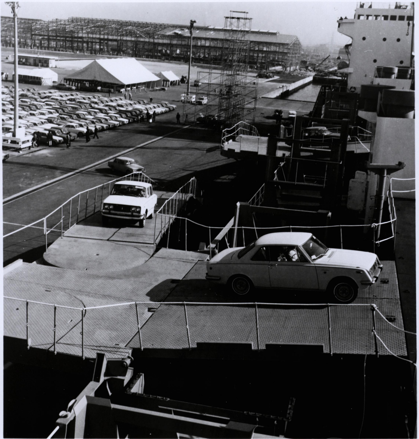
DRIVE-ON, DRIVE-OFF facilities of the new fleet of Toyota car carriers speed up loading and off-loading of the ship's 1,200 car cargo. This loading and unloading procedure also substantially cuts possibility of marine damage that can result from cargo boom loading techniques, a Toyota spokesman reported. This picture was taken at the Port of Nagoya in Japan as the Toyota Maru No. 1 loaded its 1,240 car cargo for its maiden voyage to the Port of Los Angeles, arriving there on December 6.