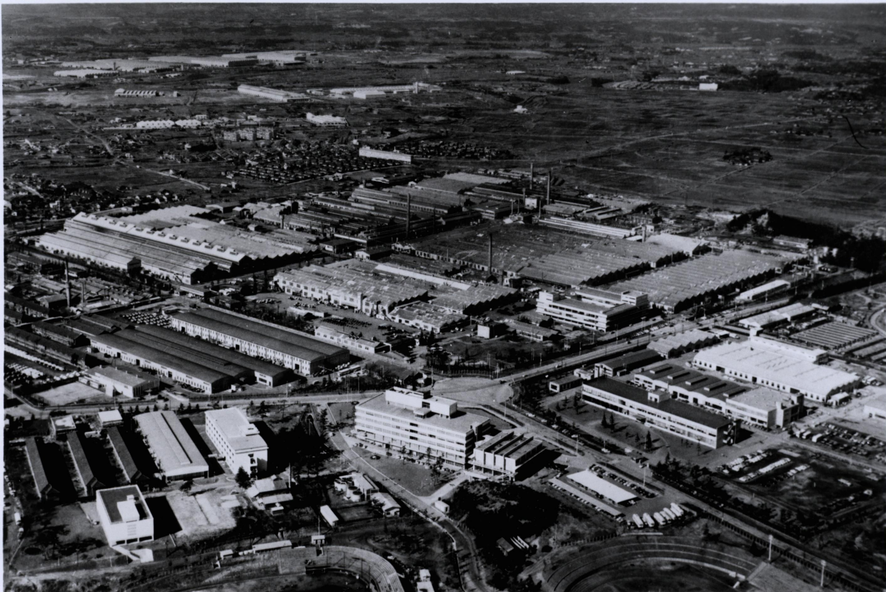
"WORLD'S MOST MODERN" -- The main plant of Japan's giant Toyota Motor Company has been referred to as the "world's most modern" manufacturing facility by leading automotive authorities. It is at this plant that the Toyota passenger cars are produced. There are five other major manufacturing plants and a number of subsidiary companies comprising the Toyota Motor Company, Japan's No. 1 automobile manufacturer. The plant is located on 784 acres in Toyota City and features over six million square feet of buildings.