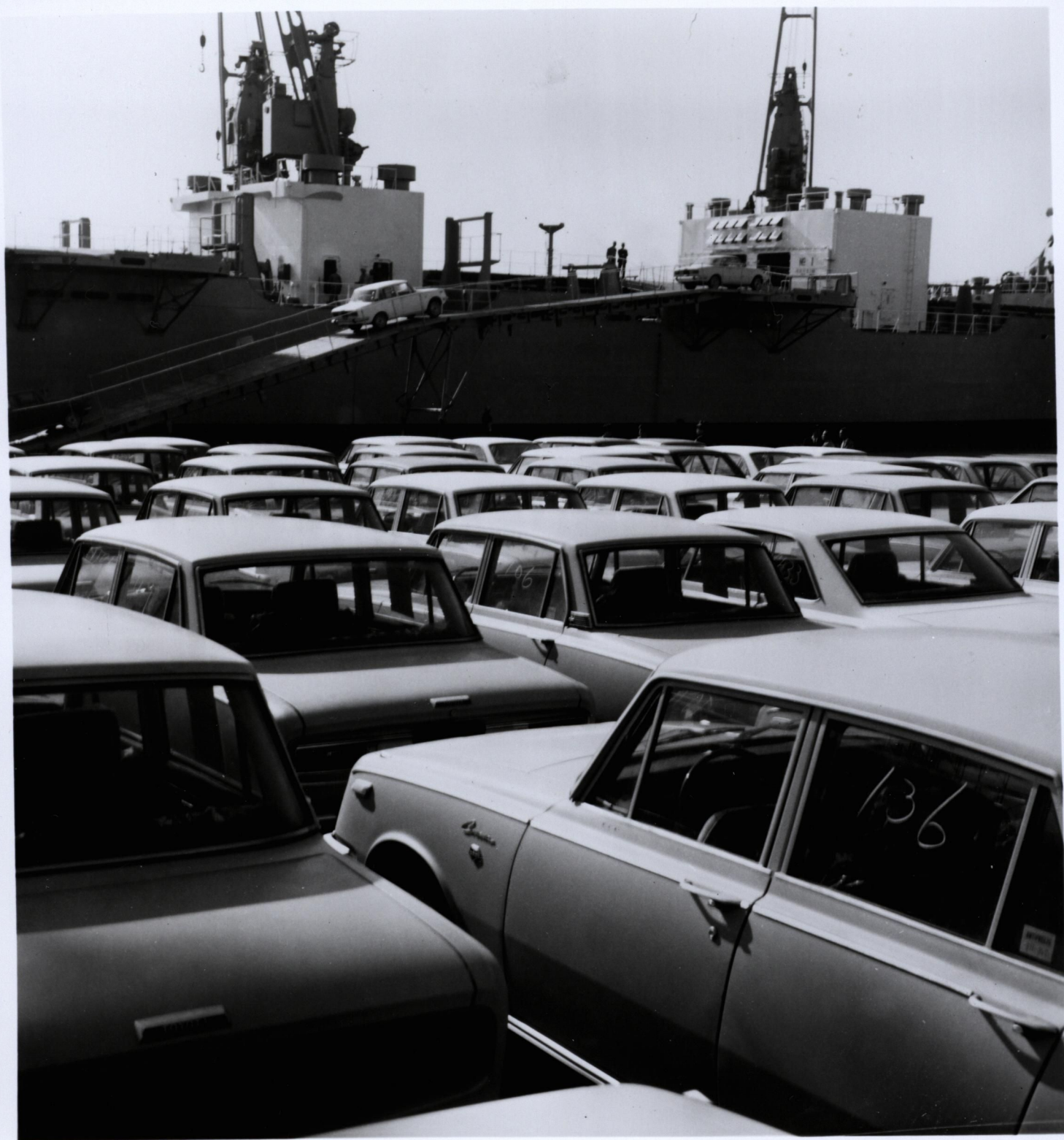
EMBARKING -- 1,240 Toyota Coronas and Corollas are being embarked aboard the Toyota Maru No. 1 at the Port of Nagoya in Japan. The Toyota Maru No. 1 arrived at the Port of Los Angeles on its maiden voyage December 6 with the 1,023 Coronas and 217 Corollas in her holds.