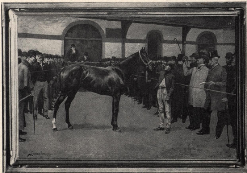
Oil — Black and White