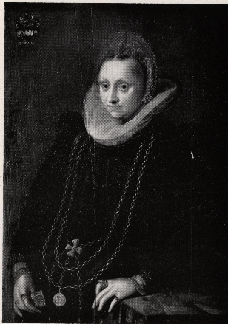
MICHEL JANSZ. van MIEREVELT