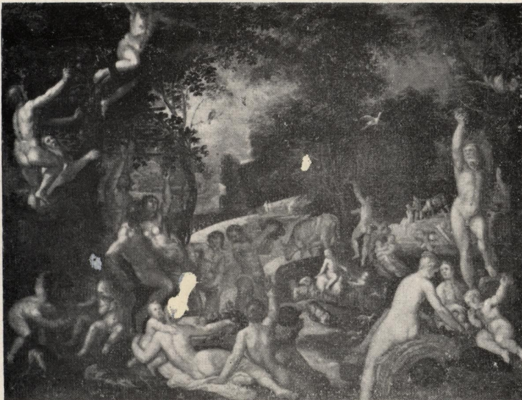
JAN BREUGHEL, THE ELDER