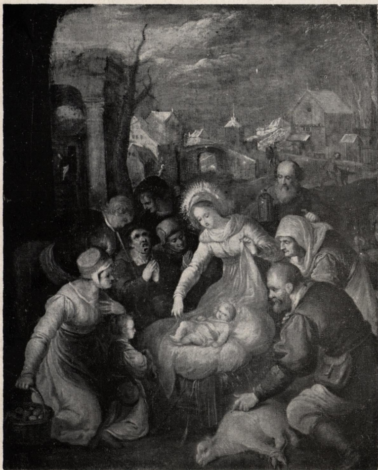
HUGO van der GOES