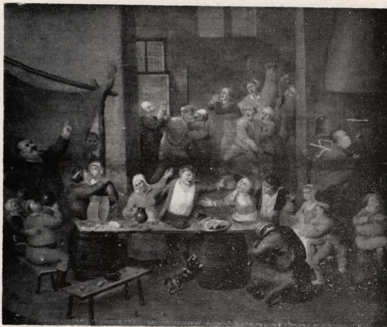
JOOS van CRAESBECK