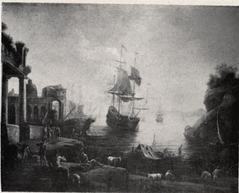
CLAUDE (LORRAIN) GELLEE