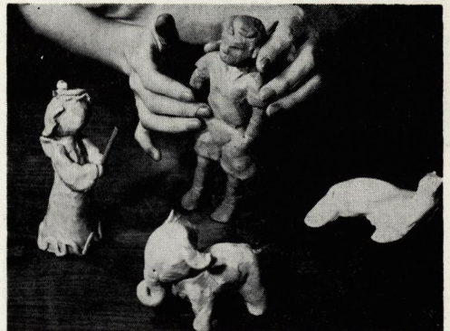
Figures may also be constructed on makeshift armatures if removed before drying. To smooth use a damp sponge.