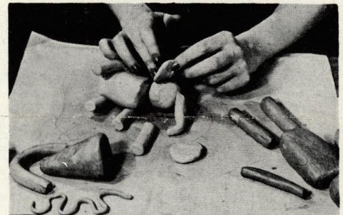
Handshaping. Construct figures and animals by joining individual parts with slip.