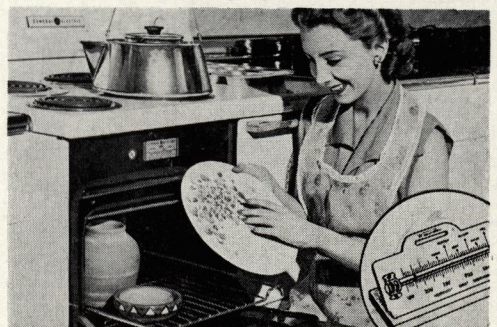
Della Robbia Miracle Clay and Glaze baked to durable hardness in your own kitchen oven! Accurate Oven Thermometer insures success of your work. Order No. T 9 $1.75