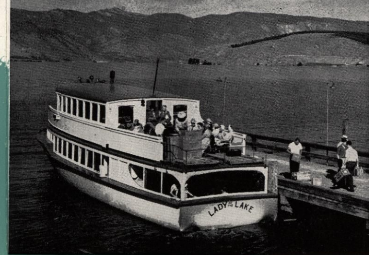
The "Lady of the Lake", one of the three comfortable excursion boats owned by the Lake Chelan Boat Co. that provide daily round trips on the lake.