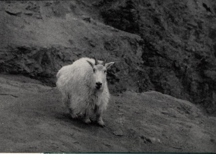
Several hundred mountain goats scale the mountains on the upper reaches of Lake Chelan. The best time of year for spotting them and taking their pictures is when the winter snow drives them to the shoreline for feed.