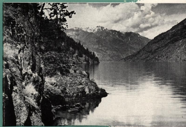
View seen from the boat about halfway up Lake Chelan. Many varied sights for the camera fan. Tourists are always thrilled with the outstanding beauty of the primitive area that surrounds this 55-mile-long lake—one of Washington state's largest inland bodies of fresh water.