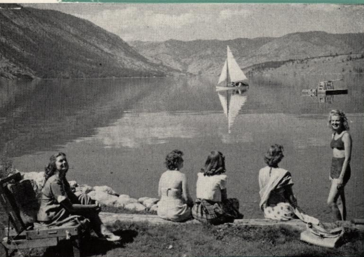
Boating, sightseeing and trolling can be delightfully combined at Lake Chelan where you can sail, row canoe or cruise in the shadow of the glacial Cascades. For visitors who do not wish to run their own boats, special trips are easily arranged on resort launches or on the "Lady of the Lake" passenger boat which makes a daily round-trip up the lake.