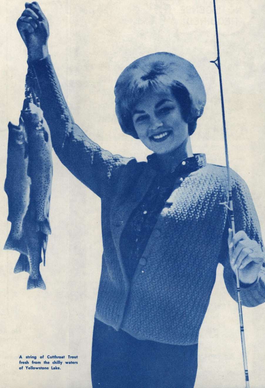
A string of Cutthroat Trout fresh from the chilly waters of Yellowstone Lake.