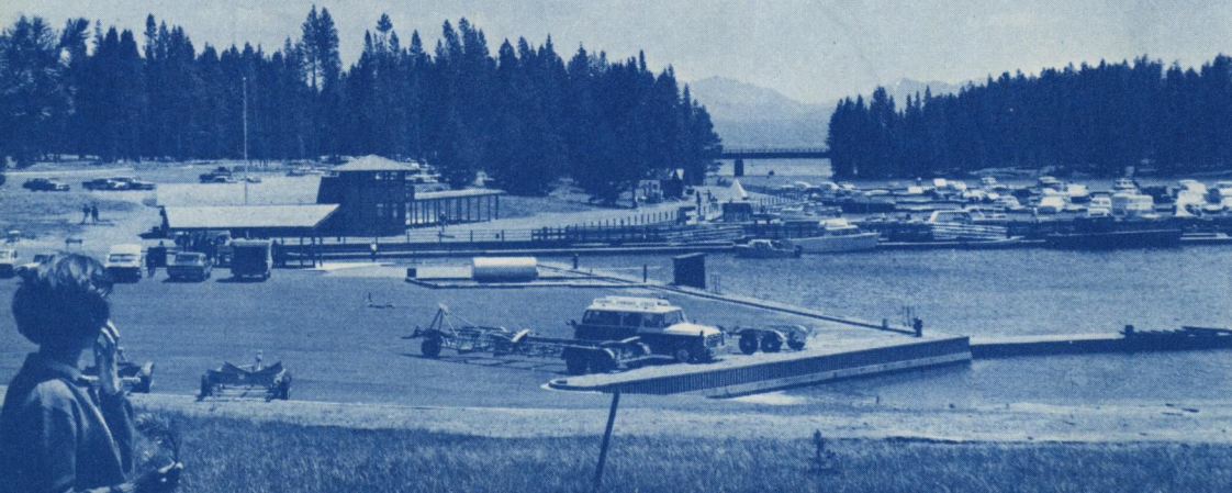
Bridge Bay Marina

Three boat docks are located on the shores of famous Yellowstone Lake in the heart of this national park. Boat rentals are available at Fishing Bridge, Bridge Bay Marina (pictured below), and West Thumb docks for as low as $1.05 per hour. Rowboats, outboards, and cabin cruisers afford the visitor a wide selection.