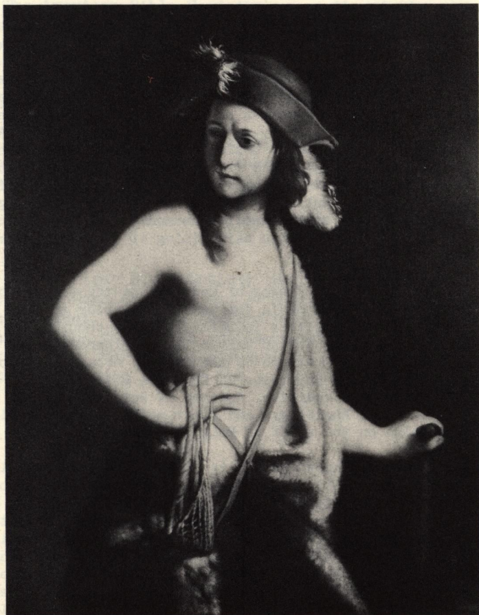
DAVID WITH THE SLING