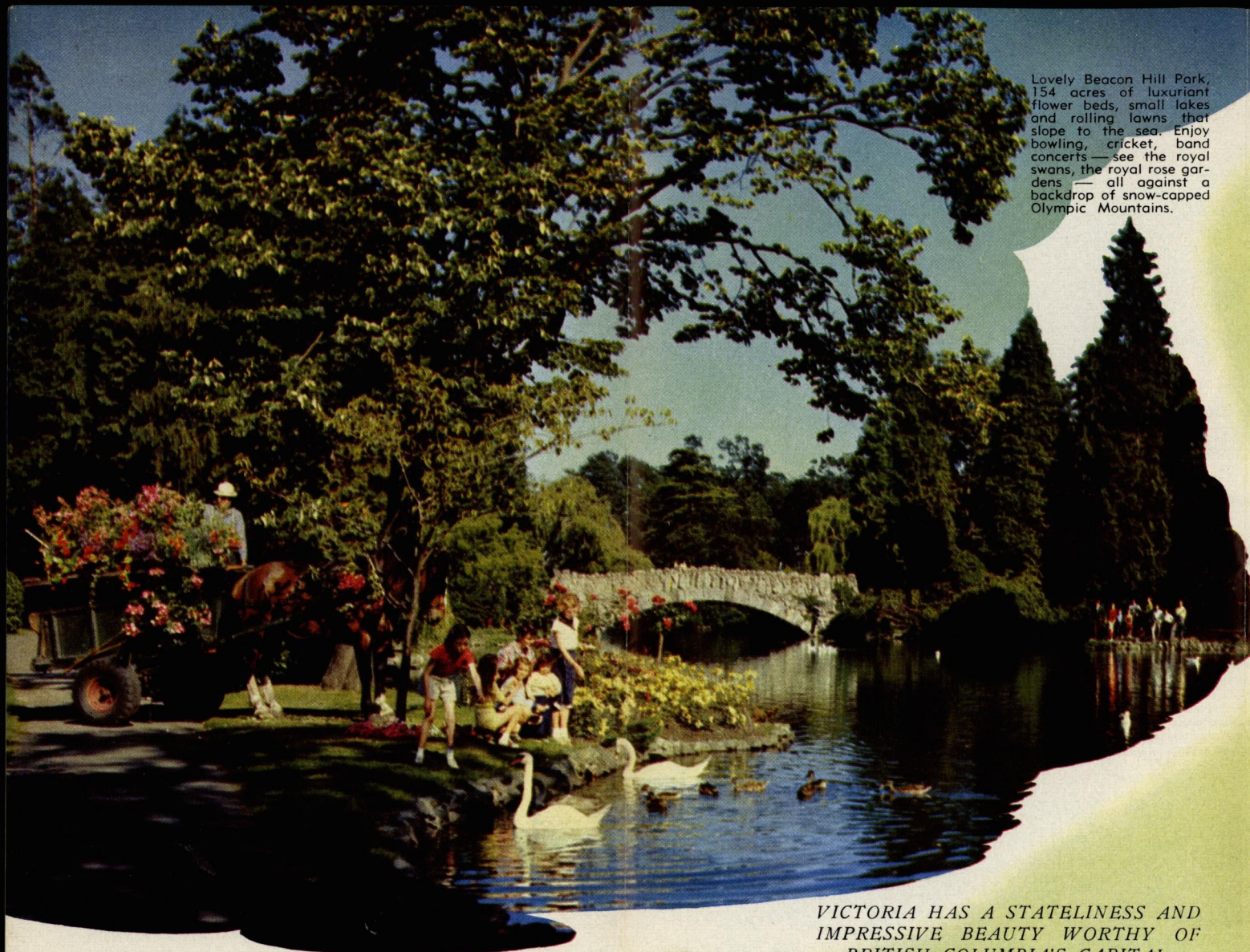
Lovely Beacon Hill Park, 154 acres of luxuriant flower beds, small lakes and rolling lawns that slope to the sea. Enjoy bowling, cricket, band concerts—see the royal swans, the royal rose gardens—all against a backdrop of snow-capped Olympic Mountains.

VICTORIA HAS A STATELINESS AND IMPRESSIVE BEAUTY WORTHY OF BRITISH COLUMBIA'S CAPITAL.