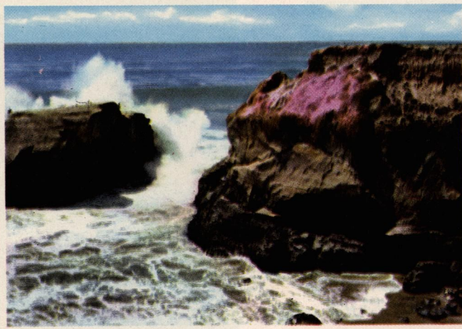
SPECTACULAR MARINE VISTA OFF WEST CLIFF DRIVE—SANTA CRUZ