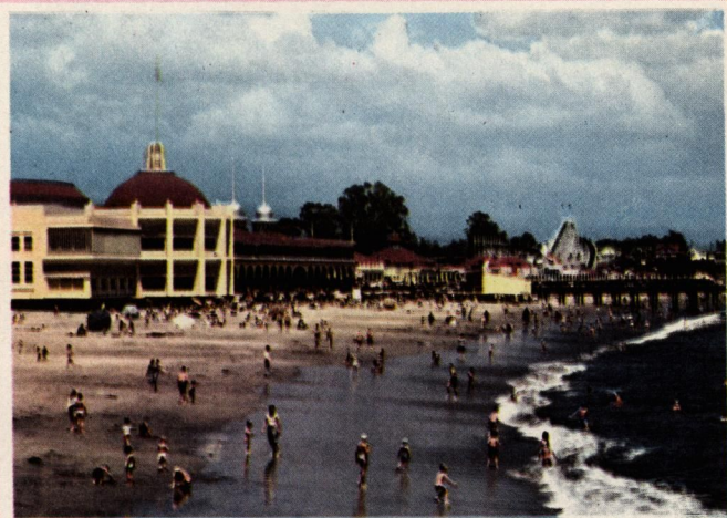
SANTA CRUZ BEACH AND BOARDWALK—A CALIFORNIA LANDMARK