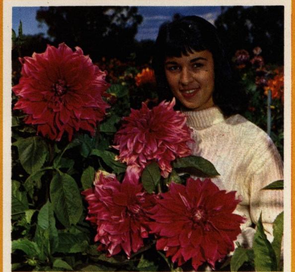
DAHLIA BEAUTY — SANTA CRUZ-CAPITOLA AREA

LITTLE WONDER—SANTA CRUZ COUNTY FOLK FERVENTLY BELIEVE THEY ARE LIVING IN A VALHALLA ON EARTH.