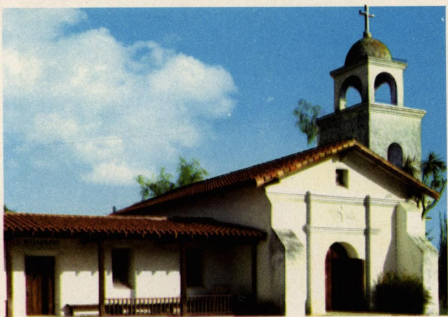
HOLY CROSS MISSION—ESTABLISHED 1791—SANTA CRUZ