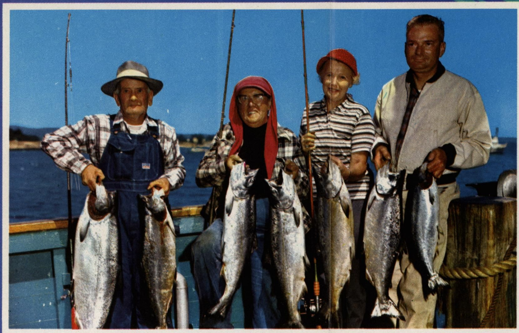
Sports Fishing for Salmon on Waters of the Santa Cruz Main ...

ATTAINING THE PARADISE OF ALL CALIFORNIANS IN THE HEREAFTER DOES NOT GREATLY CONCERN THE RESIDENTS OF SANTA CRUZ COUNTY . . .