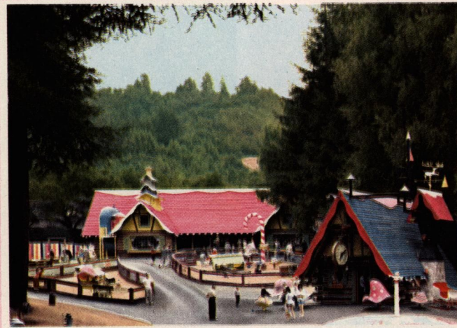
SANTA'S VILLAGE—AT SCOTTS VALLEY