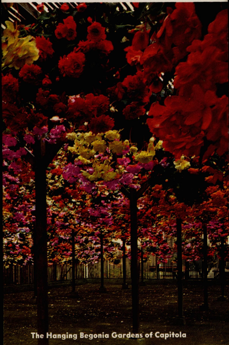
The Hanging Begonia Gardens of Capitola