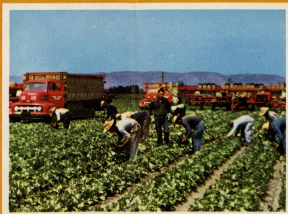
SALAD BOWL OF THE STATES—HARVESTING OF LETTUCE AT WATSONVILLE