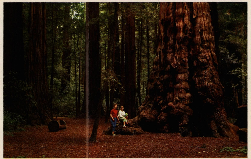
GENERAL SHERMAN TREE — HENRY COWELL REDWOODS STATE PARK