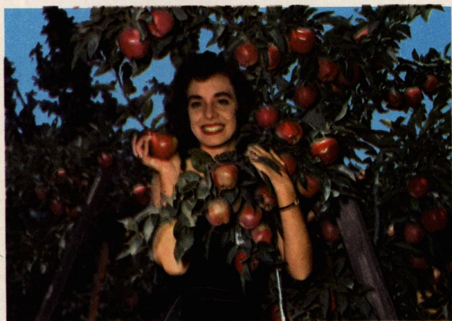
WATSONVILLE—PROUDLY PRESENTS—RED DELICIOUS APPLES