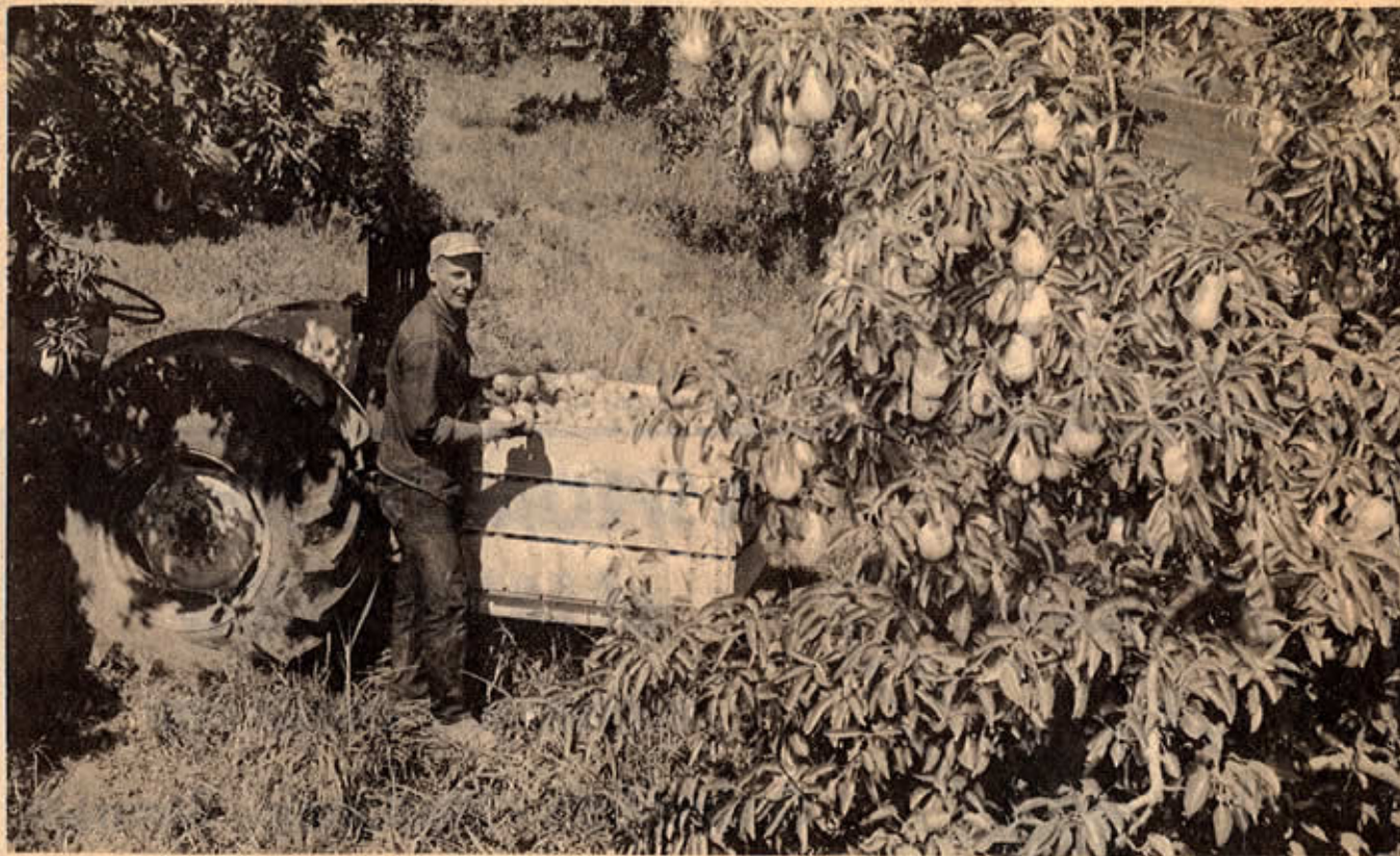
TONS OF PEARS —Every year Yakima Valley orchards contribute tons of pears to the economy of the Valley. Several

varieties are grown but the canning pear leads all the others in quantity.