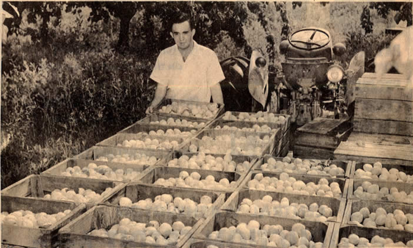
SOFT FRUIT —Apricots, peaches, cherries, plums and prunes are grown in the Yakima Valley, both for the fresh market and for canning. Like pears, they are responsible for many jobs in

varieties are grown but the canning pear leads all the others in quantity.