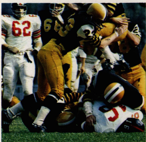
Football fans cheer for nine professional teams from the stands of big-capacity stadiums. The season winds up with the annual classic match for the Grey Cup, at the end of November.