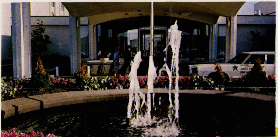
Motels, hotels, boatels are springing up at a staggering rate. At last count Canada could accommodate 500,000 visitors at a time.