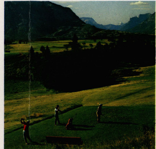
Golf has many devotees in Canada. Fairways range among the world's finest for both hazards and scenery. In Jasper National Park every green is lined up with a separate mountain peak.