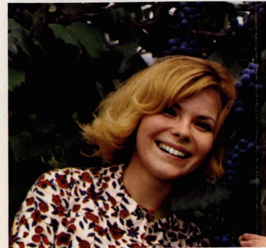
In Niagara the harvest is grapes and the season's celebration is a Grape and Wine Festival held late in September, with parades and entertainment led by a "Queen", a "King" and a "Pied Piper".

This is harvest time for sportsmen, the cross-roads of all seasons. Fishermen reel in the last trout and hunters set their sights on moose. Football fans throng stadiums. Tennis players and golfers, free from summer heat, find renewed energy. Yachtsmen welcome new winds the change of season brings. Thanksgiving is a holiday with more meaning than a meal of traditional turkey, it is a counting up of joys, a totalling of satisfactions, a fine time to be in Canada.