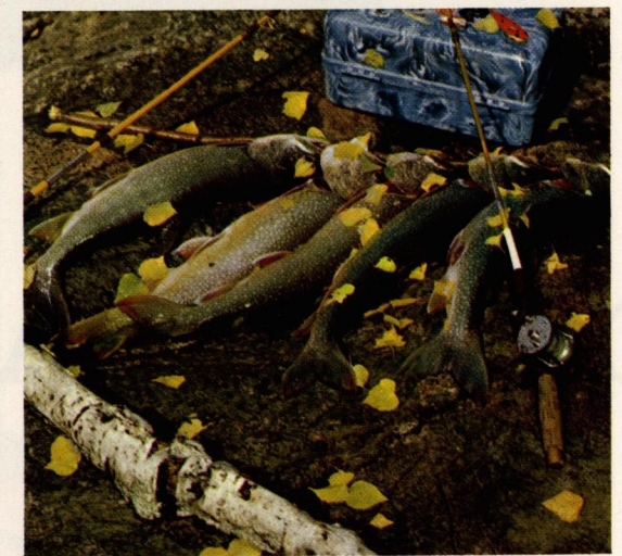
When water cools in autumn, fish rise from deep lakes and fishermen change to light tackle and new tactics. Regulations, bait tips and species vary from province to province.