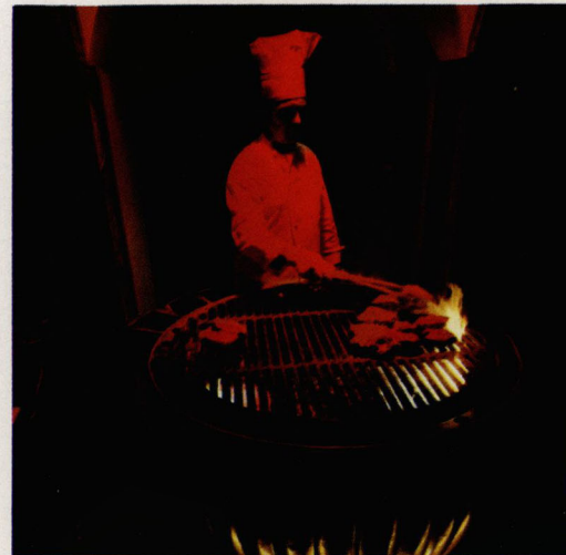
Good Food , now that is something we have plenty of, familiar or foreign, according to taste. Gourmets find special pleasure in dishes distinctively Canadian, or French cuisine, our cultural legacy.