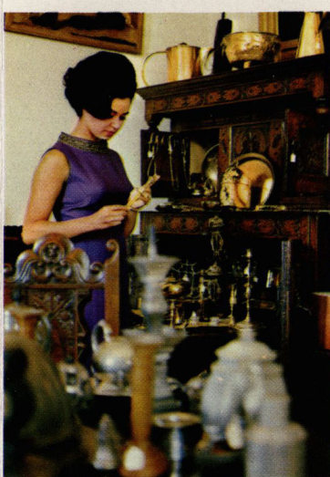
Shopping is at year's best. With Christmas in sight, stores are stock-full of goodies. At least enjoy the fun of looking, as "Made in Canada" means things you may not find at home.