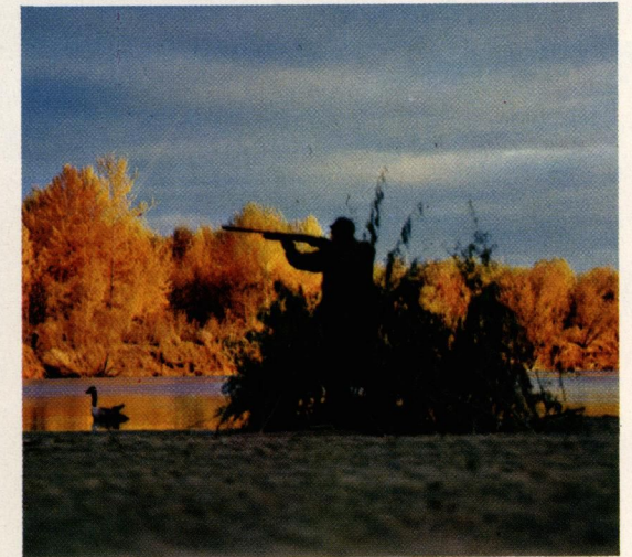
Autumn is duck-shooting time. Migratory birds are well protected and the season's dates and bag limits set each year after an official duck-count, an international concern, has been taken.