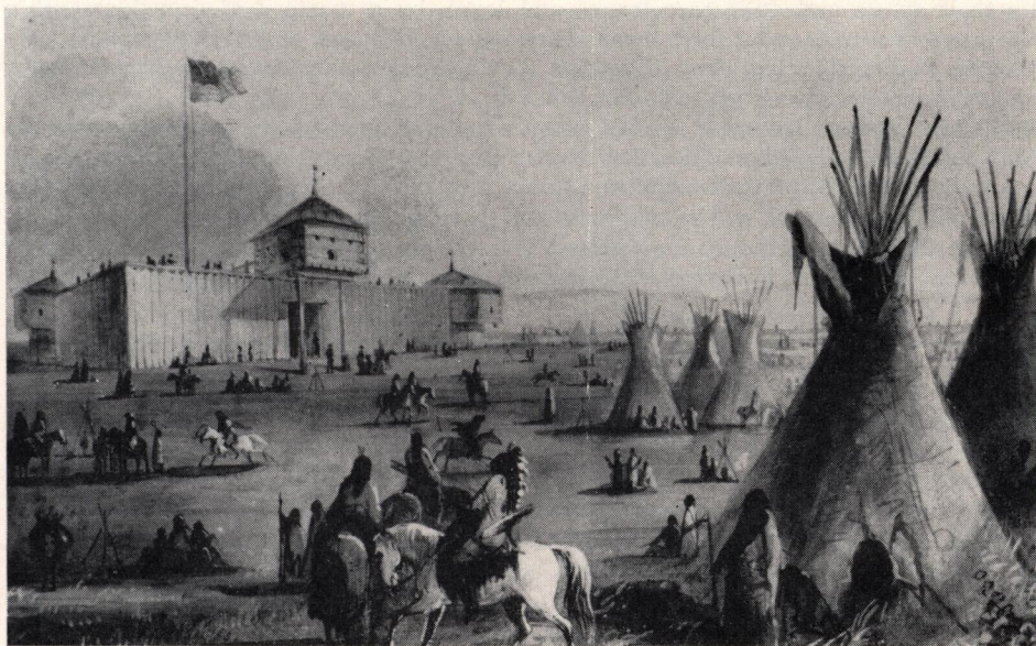
FORT LARAMIE ON SUBLETTE'S FORK NEAR THE NEBRASKA OR PLATTE RIVER