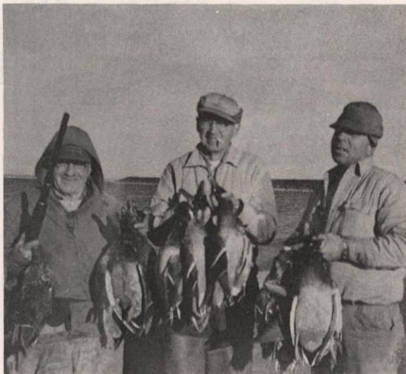
SEEING IS BELIEVING: THE BOYS FROM THE MAR-DON WITH A DAYS LIMIT OF FINE MAL- LARD DRAKES

A SPORTSMAN RESPECTS THE RIGHTS OF OTHERS