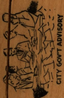
CITY GOVT ADVISORY