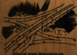
ROADS AND HIGHWAYS