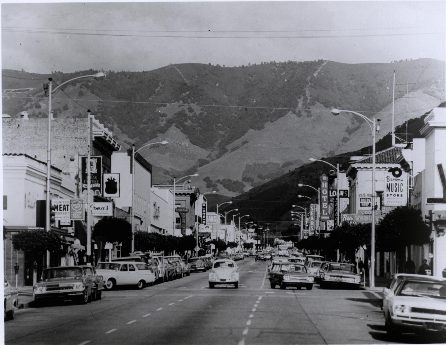
Living is leisurely in San Luis Obispo, resort and recreation center three hours north of Los Angeles, in a valley sheltered from the sea by steep oak-clad hills.