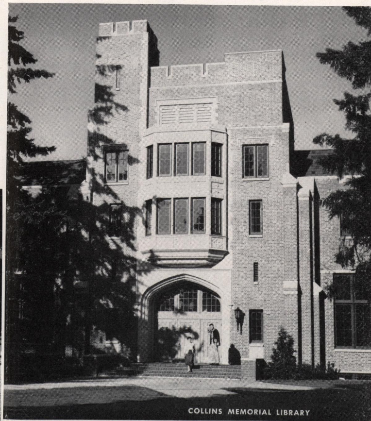
COLLINS MEMORIAL LIBRARY

BOARD. All campus residents dine in the college commons located in the Student Union Building. All meals are planned by a professional dietician providing for a wholesome, balanced diet. Board on a 6-day basis is $150 per semester.