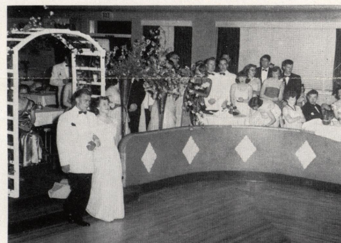
NATIONAL SORORITIES AND FRATERNITIES provide an exciting calendar of dances, banquets and fireside parties. Rush affairs begin at least two weeks before the fall term begins and are regulated by Panhellenic and Inter-fraternity councils.