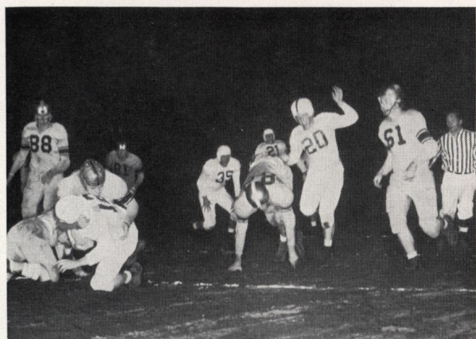
ATHLETIC PROGRAM. CPS is a member of the Evergreen Conference. It participates in all major and minor sports, in varsity and intramural programs. Included in women's athletics are field hockey, basketball, volleyball, badminton, tennis, golf, archery and fencing.