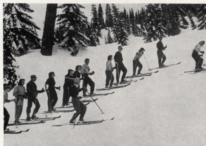
WINTER SPORTS are popular at CPS. Deep Creek Lodge, near the slopes of Mt. Rainier, is owned and operated by the college and is available to all CPS students for winter weekends of skiing, hiking and skating.