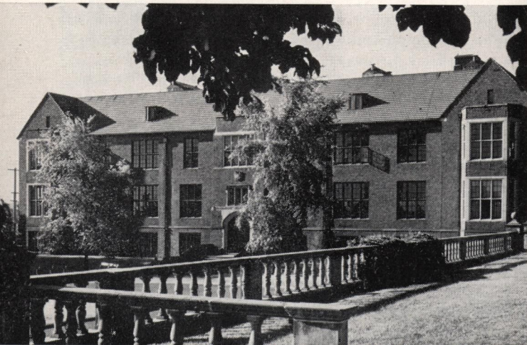
HOWARTH HALL, Science Building

TRANSFER. A student wishing to transfer from other institutions of higher learning should notify the college of his intent and request each former college or university to forward a transcript of his record to the CPS Registrar. Here again a careful evaluation of the student's record will be made. If likely success in the chosen course of study is indicated, admission to advanced standing will be granted.