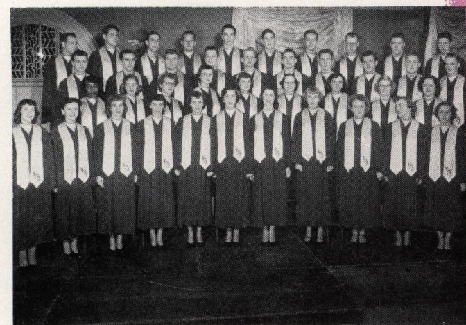
MUSIC ON THE CAMPUS. The Adelpian Choir has focused attention on the college's excellent music opportunities. Among the activities are the symphony orchestra, concert band, workshop band and vocal and instrumental groups.