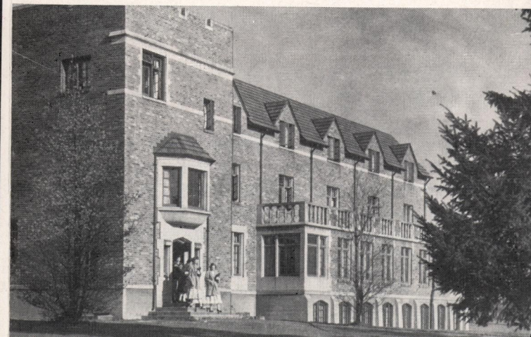
ANDERSON HALL, Women's Residence

A job placement bureau is maintained by the college to assist students with part time work programs. The Deans of Men and Women particularly assist new students in the matter of employment and inquiries concerning such work should be addressed to them.