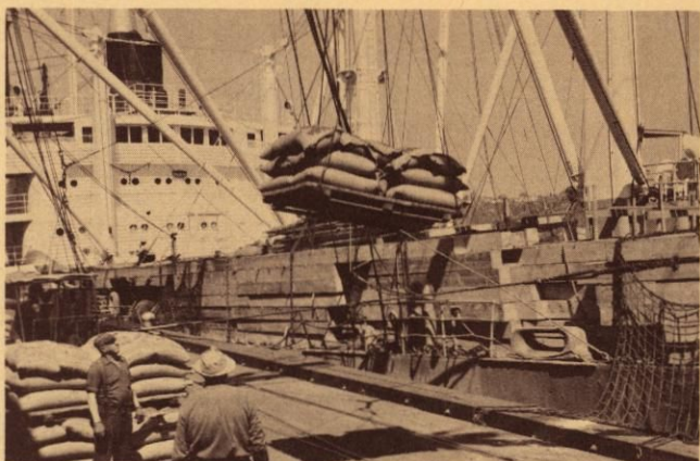
Portland Harbor is equipped to handle all types of general and bulk cargoes.

ment. Actual cargo handling procedures and a good, close look at a merchant ship are also a part of the tour. Continuing, you will see the waterfront industries of the harbor and learn of their roles in making Portland a great seaport. At Terminal No. 4, you will see the largest grain elevator on tidewater west of the Mississippi River, an 8 million bushel giant. Here too, is the home of the West Coast's fastest bulk unloader. Ores, ore concentrates, manganese, limestone, and a host of other materials are lifted from ships and barges, 13 tons at a time, in less than a minute.