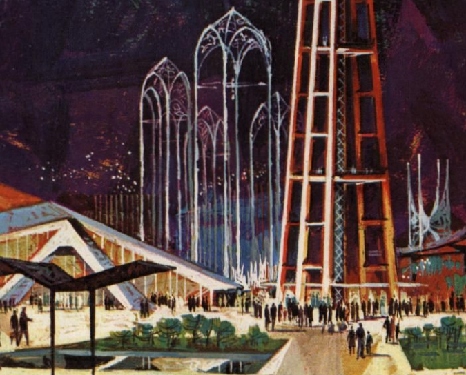
The 600-foot Space Needle, with its celestial observation deck and revolving restaurant.