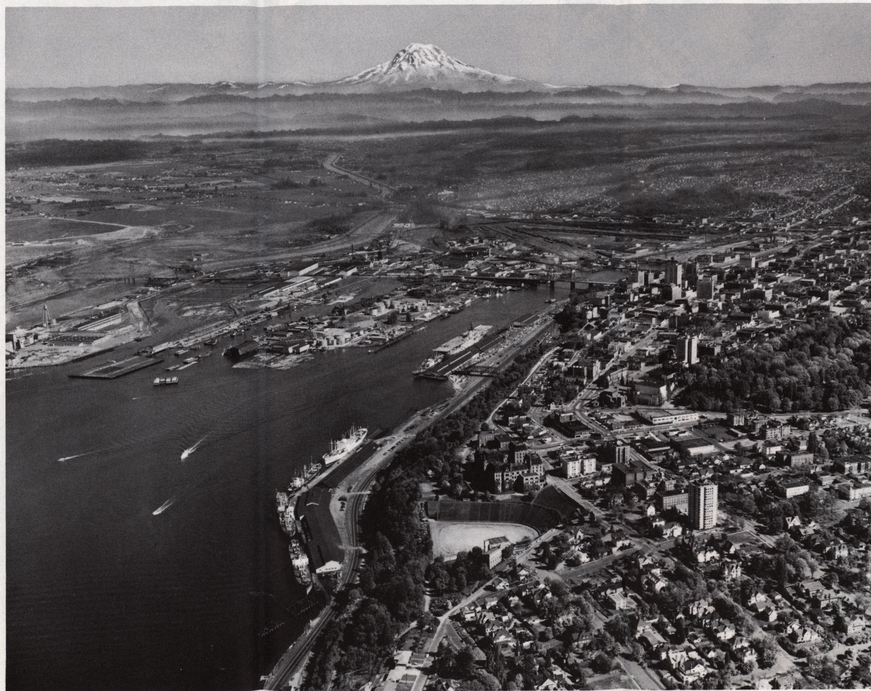
Tacoma, Washington — Mount Rainier in Background

As the attached map indicates, the Port of Tacoma has 1,500 acres of industrial land available for future industries, truly a positive indication of the potential growth of the industrial area and of the City of Tacoma.