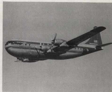
Stratocruiser - 1949 - 83 psgrs - 320 mph