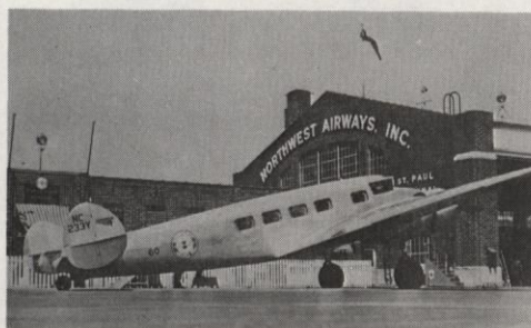
Electra 10-A - 1934 - 12 psgrs - 190 mph