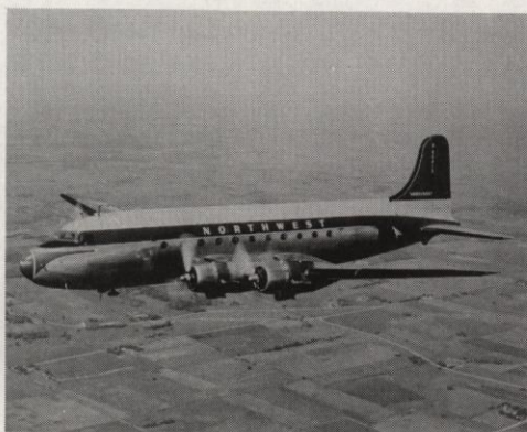
Douglas DC-4 - 1946 - 62 psgrs - 225 mph