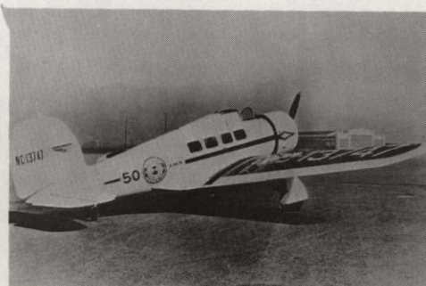
Lockheed Orion - 1934 - 6 psgrs - 205 mph

Yes, I would like to receive glossy photos of the aircraft as checked on this sheet.