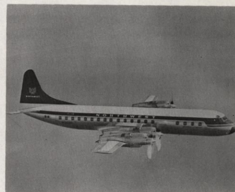
Electra II - 1959 - 72-90 psgrs - 400 mph