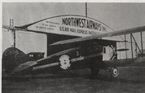
Stinson Detroit - 1926 - 3 psgrs - 85 mph

Completing 35 Years of Superior Airmanship