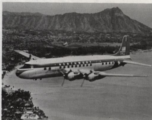
DC-6B - 1953 - 64-76 psgrs - 315 mph