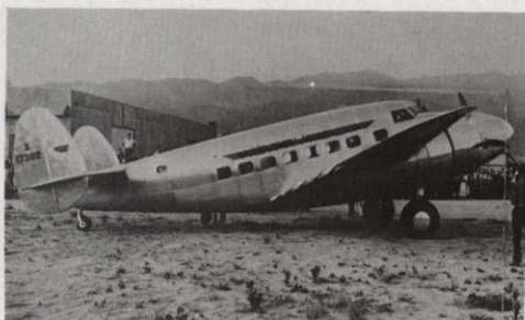
Lockheed Zephyr-14-H - 1937 - 14 psgrs - 223 mph

Completing 35 Years of Superior Airmanship Years