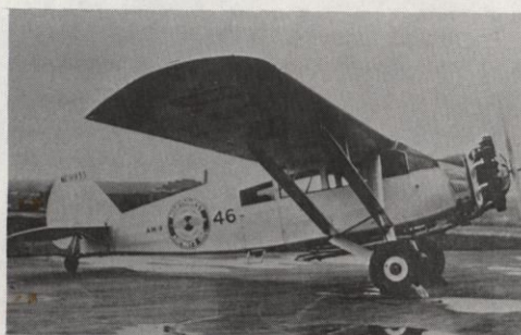
Travelaire 6000 - early 1930's - 8 psgrs - 120 mph