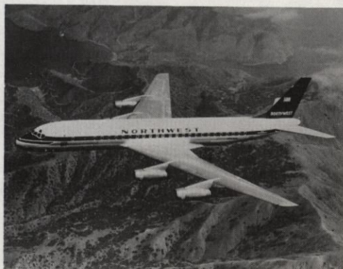
DC-8 jet - 1960 - 107 psgrs - 585 mph