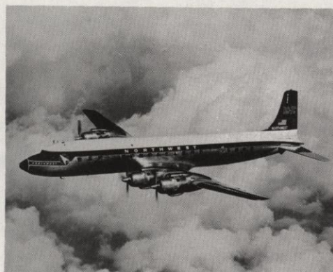
DC-7C - 1957 - 72-95 psgrs - 348 mph