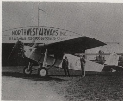
Hamilton - 1928 - 6 psgrs - 110 mph