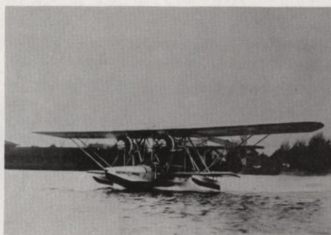
Sikorsky S-43 - 1931 - 10 psgrs - 120 mph