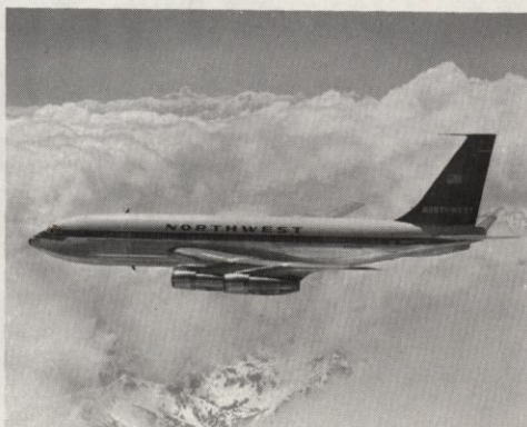
720B fan jet - 1961 - 107 psgrs - 623 mph

Yes, I would like to receive glossy photos of the aircraft as checked on this sheet.